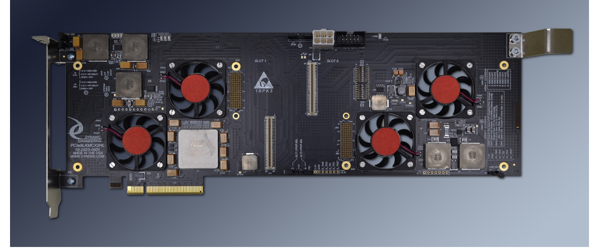
PCIe8LXMCX2HL front view with Fans installed

Copyright© 1988-2023 Dynamic Engineering. All rights reserved All other trademarks are the property of their respective owners.