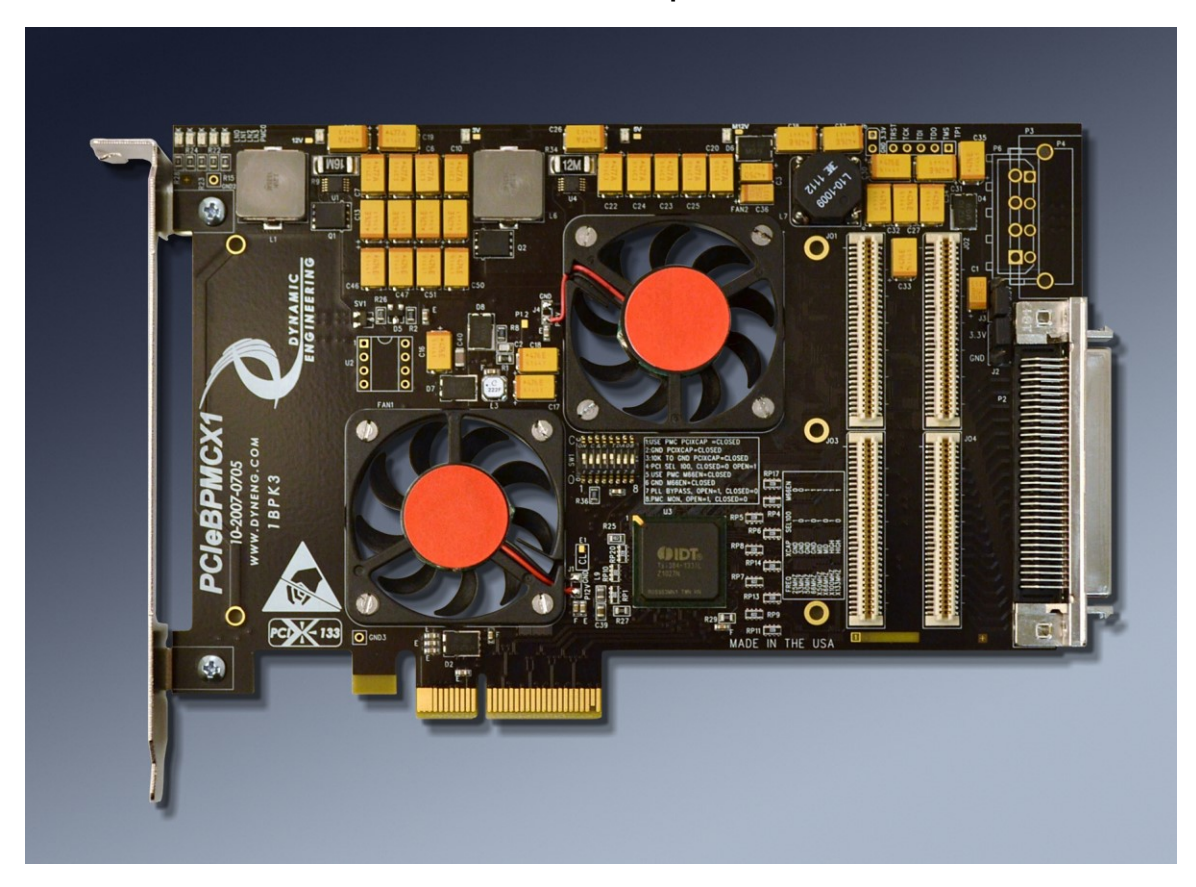
PCIe, PCI and PMC Compatible Carrier